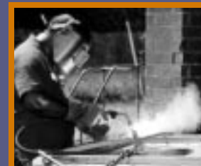
In Your World: Maddox Foundry