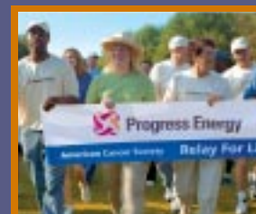
Building Stronger Communities